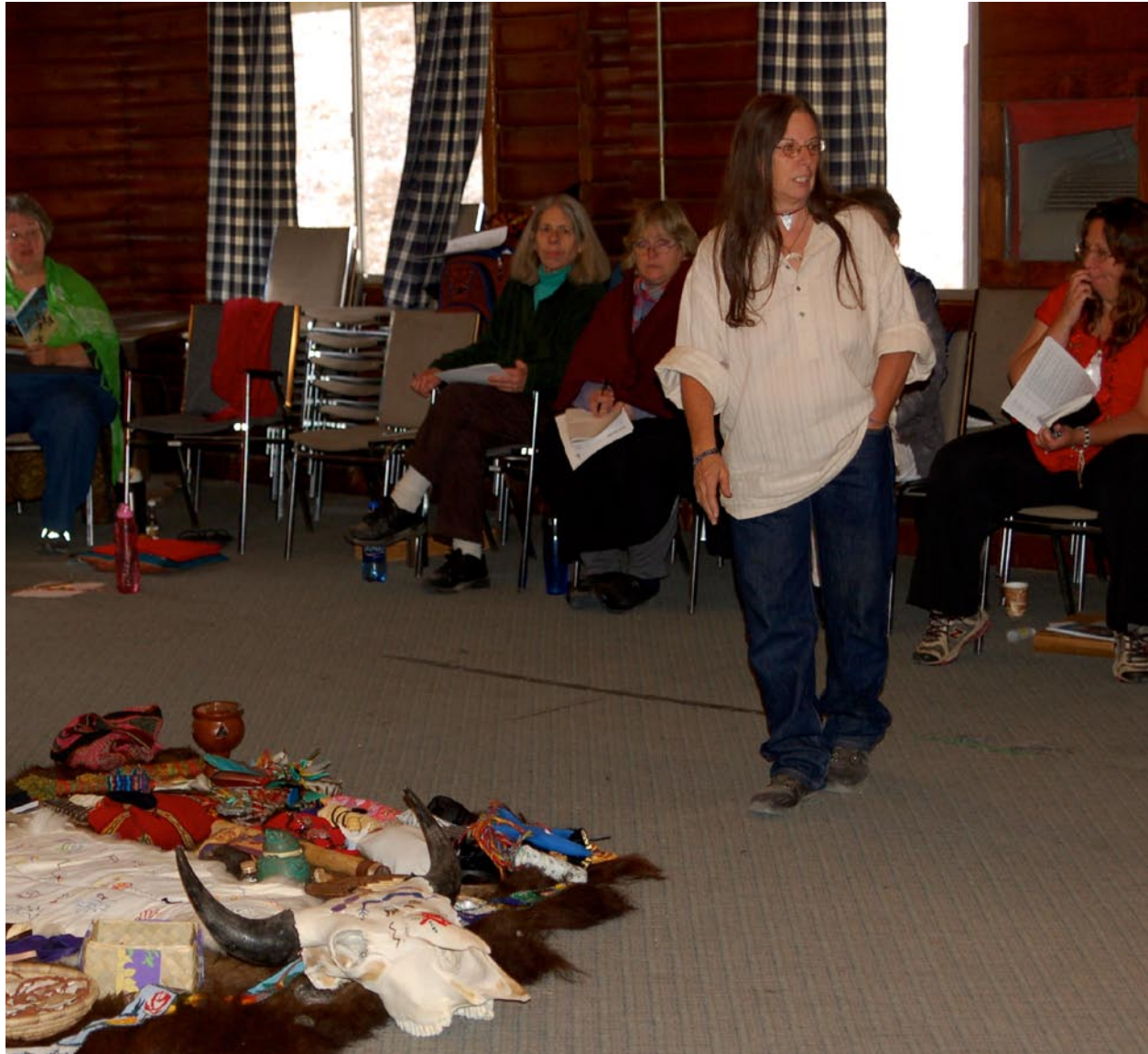
2011 2nd Annual Sisters of Honua Grandmothers Summit