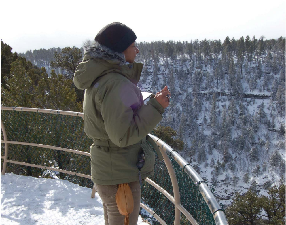
Bear Rock, Changing Mother, rain clouds from northeast to southwest. Topaz blue light between sky and rain clouds... from Black Coyote.